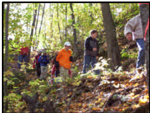
A view of one of the steep sections on LookOut Trail.