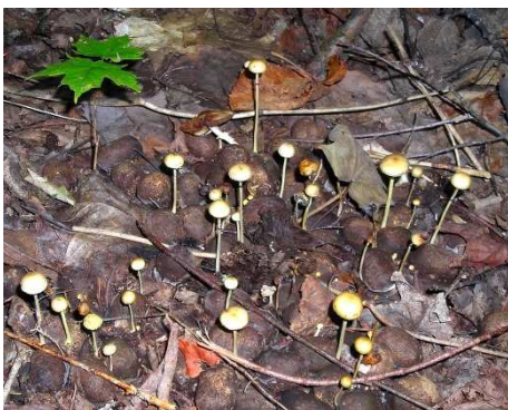
A moose left piles of scat near the "Easy Trail" in 2011; on each pile, and nowhere else, we found a curious mushroom: Stropharia semiglobata is found only on aged moose scat or horse dung. The mushroom is said to be edible.

Birding Excursion: 8 a.m. May 19, 2013 with Club des Ornithologues. Bilingual. Free to Mont O'Brien members and their guests. Please call or email a board member to register.