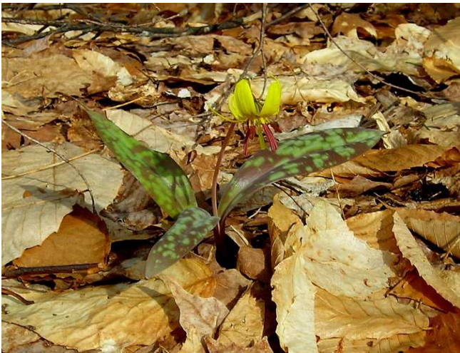
New life at Mont O'Brien, blooming again in early May: Trout lily, also known as Dog-toothed violet.