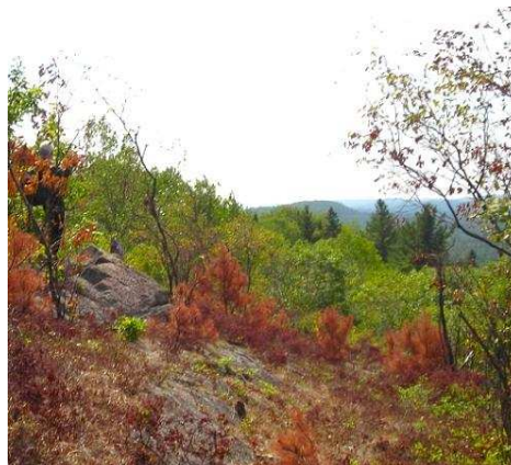
Terrible local drought in the summer of 2012 killed trees on exposed thin soil—this is on a ridge within the Reserve, south of Mont O'Brien and Range Lake.